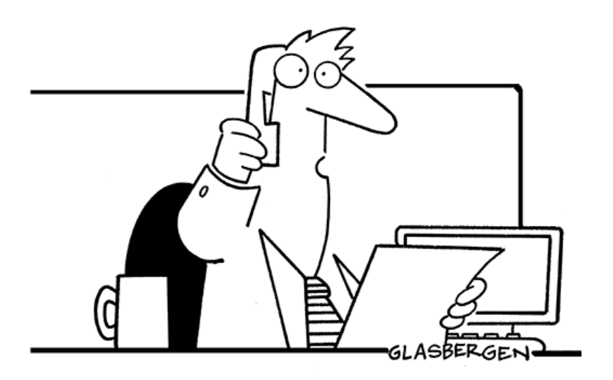
"The old woman who lives in a shoe is covered for fire, theft and liability ...but not athlete's foot."